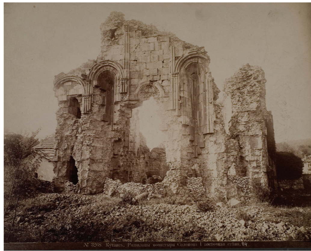
Ruins of the Cathedral, 1900s