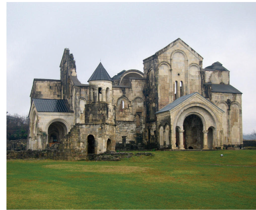
Cathedral after the restoration, 2007