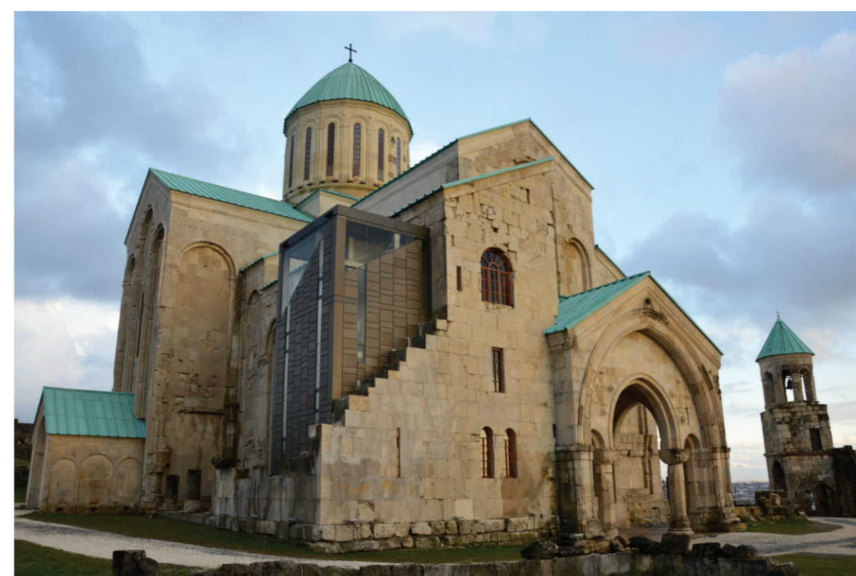
Exterior of the Cathedral after the reconstruction, 2013