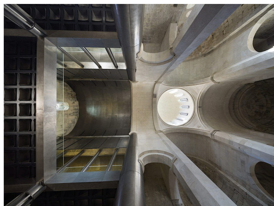
Interior of the Cathedral after the reconstruction, 2012

Bagrat's Cathedral within its essence and image became a symbol of the idea of the united Georgia and a reflection of a ruler at the same time.