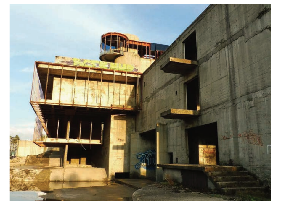
House of Revolution in reconstruction progress, Nikšić 2021

Time will show what the fate of the House of Revolution will be.