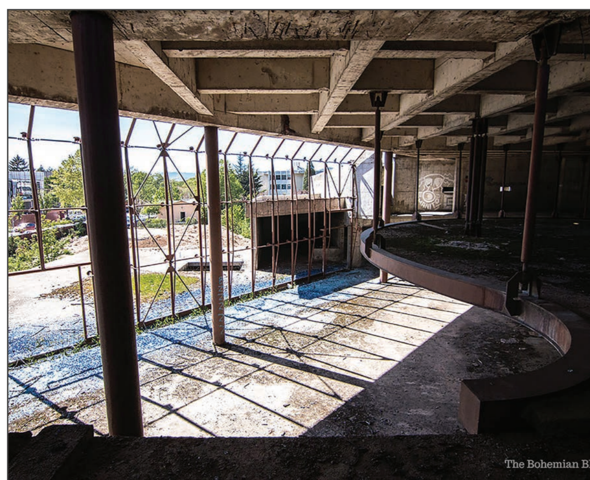
Broken glass and gentries on the ground floor plaza, Nikšić