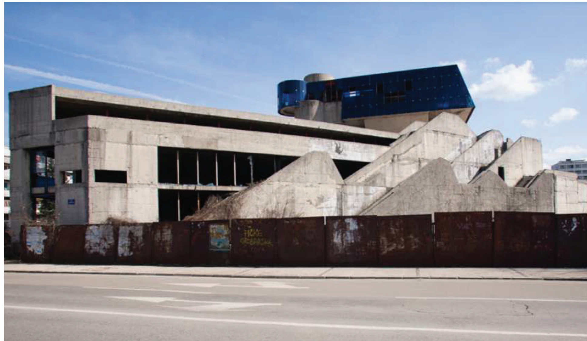
A memorial centre celebrating Yugoslav unity and the efforts of the socialist revolution Memorial building House of Revolution, an Indicator of Urban Identity Transformation of Nikšić city, 2015

In the former Yugoslavia during the 70's, it was common to build memorial monuments and buildings. One of those is the House of Revolution, the project in which the politicians had trusted.