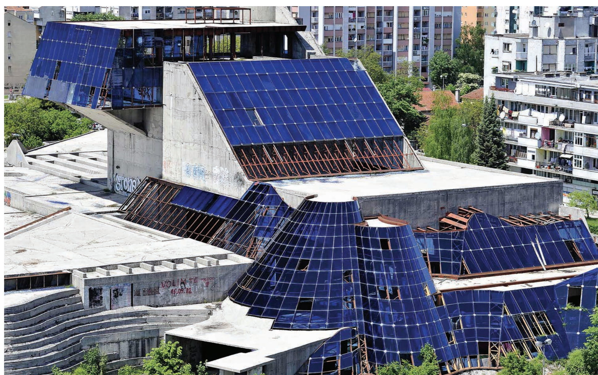
View from the top of the building, with red metal trusses that made a concrete structure, and all of that was covered by a shell of blue, bright and crystal glass.