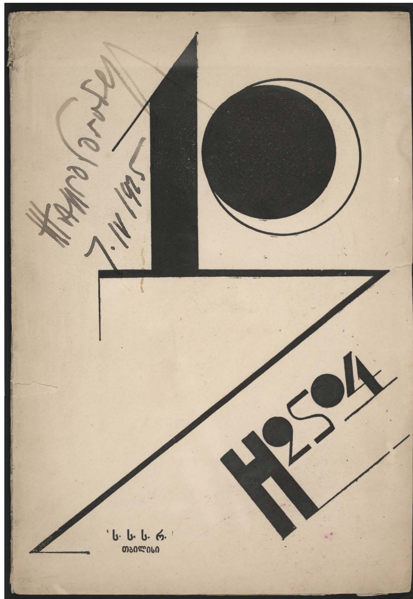
I. Gamrekeli, Cover of H2504 magazine, published by Dadaists in Tbilisi, Georgia, 1924.

Modernist art of Georgia, a small country of ancient culture, which is located on the outskirts of Europe, is a very interesting phenomenon. Because of the well-known historical and political reasons this cultural realm still remains unknown for the western world. In 1910-1920s abundance of creative energy, emergence of lively and active artistic environment transformed Tbilisi into a cultural center that was compatible with its contemporary European avant-garde counterparts.