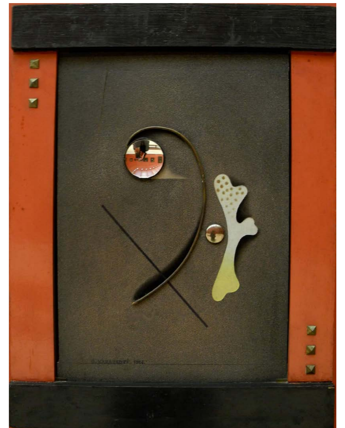
D. Kakabadze, Constructive and Decorative Composition; Wood, metal, glass, tempera; 1924; Sh. Amiranashvili Museum of Fine Arts.

On the contrary to the Georgian symbolist or futurist poets modernist artists did not form any formal artistic group as they did not give specific preference to any of the modernist movements. Their creative life took individual independent paths. However, all of them pursued common and very important interest towards ancient culture of the country replicating medieval wall drawings – a goal that would not only be unimaginable for European avant-garde artists but also rejected by them on conceptual level.