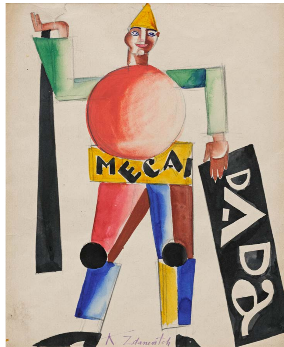
K. Zdanevich, Sketch of a costume for the play Malstrom; Paper, watercolor, gouache; 1924; Georgian State Museum of Theatre, Music, Film and Choreography.

After the end of the I WW and collapse of tsarism, even before Georgia became independent, numerous poets, painters, actors and musicians escaped Russia in order to find their new home in Tbilisi. Obviously their choice was not accidental as along with a better political and economic environment Georgia could offer them a very lively intellectual life. According to Osip Mandelstam the country “was perceived as a new Switzerland, a neutral and [...] sinless tiny piece of land”.